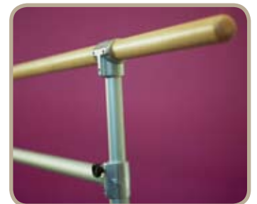
Simple height adjustment system

Top of the range the 3 metre hardwood timber stretching barre is strong and durable with a warm and natural feel. The timber is finished to a satin gloss in durable two pack epoxy and comes in a fixed (TD) or height adjustable model (TDJ) with a 350mm travel on the top barre.