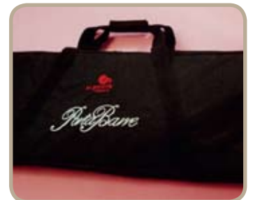
Comes in its very own carry case

The 1.4 metre barre is ideal for home use whilst the Professional Barre can extend out to 4 metres and can accommodate up to six dancers. Perfect for the dancer on the move.