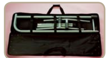
Folds nicely away