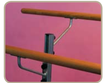
Detail of height adjustment

This double barre barre has been designed to maximise available floor space and is twice the “bang for your buck” with a single unit accommodating twice the number of Dancers.